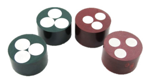
Figure 2: Aluminum rods (green) and steel rods (red) were mounted in phenolic.

The mounts were then ground using 1200 (P-4000) grit and 1200 fine grit to compare material removal using the procedure outlined in Table 1. Only one abrasive disc was used for each test; the disc was not changed in order to determine durability for each set of conditions. Material removal was checked every minute using a digital indicator measurement system.